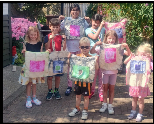
The Herd - Pop-Up Play