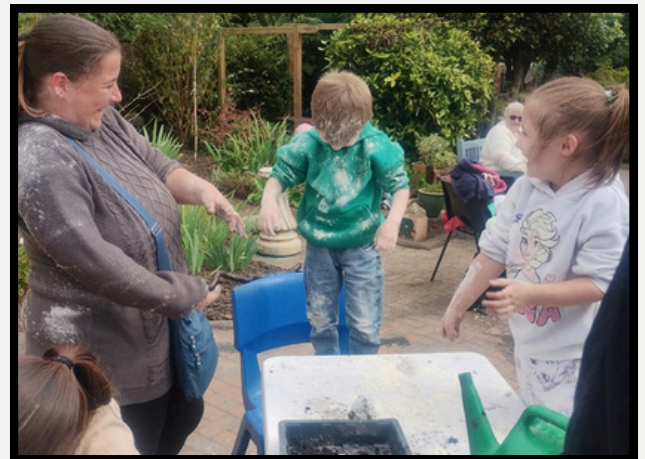
Flour fights making the seed bombs →